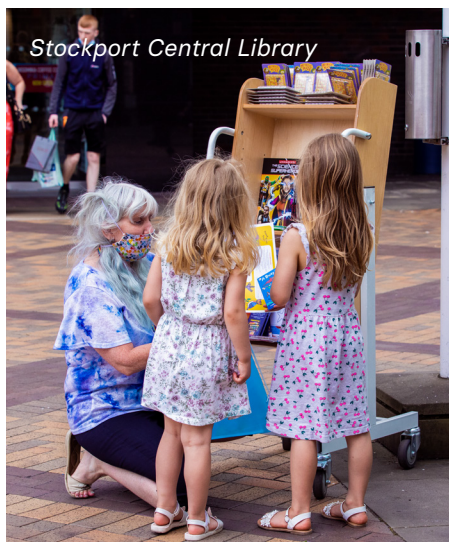
Stockport Central Library

Reading Rocks! at Rochdale Central Library Sat 10th June, 11am-1pm