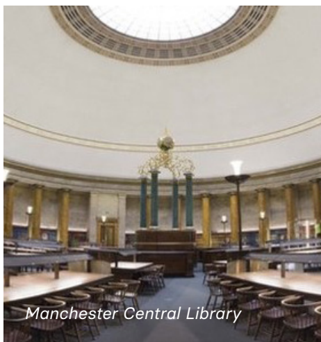
Manchester Central Library

This event is in partnership with Creative MCR.