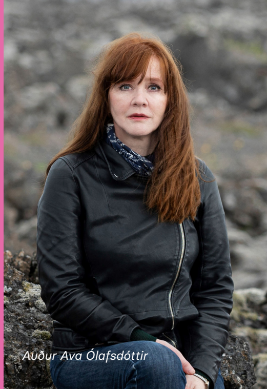
Auður Ava Ólafsdóttir

Auður Ava Ólafsdóttir is a prize-winning novelist, playwright and poet. She also writes lyrics for the Icelandic performance pop band Milkywhale. Her novels Animal Life , Hotel Silence , Miss Iceland and Butterflies in November are published by Pushkin Press and have been translated into over 25 languages. Hotel Silence won the Nordic Council Literature Prize, the Icelandic Literary Prize, and was chosen Best Icelandic Novel in 2016 by booksellers in Iceland. Whilst each of Auður Ava's novels feature different characters and themes, her writing is always beautifully crafted and features fine observations on nature, life, death, friendship and the human spirit. Auður Ava lives in Reykjavik City of Literature.