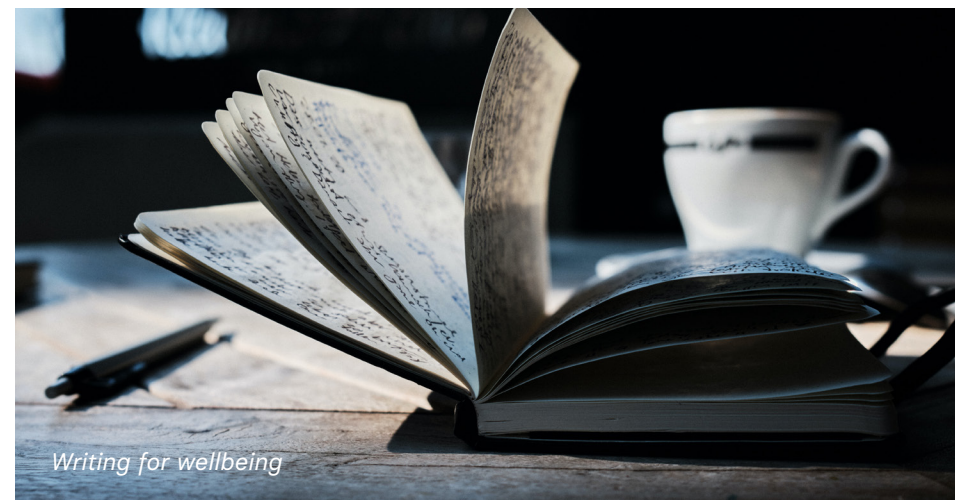
Writing for wellbeing