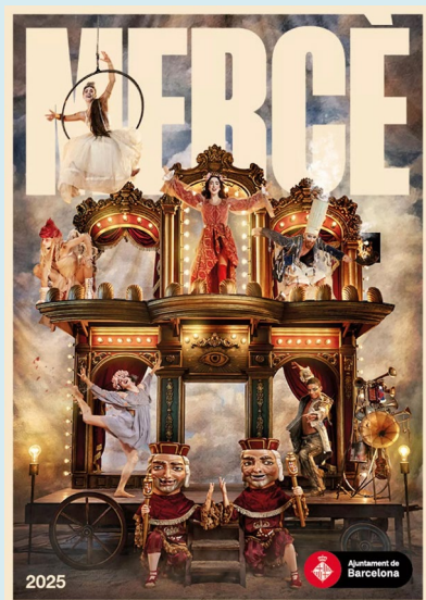
Image credit: Lluís Danés, Artistic Director of the 2025 La Mercè poster

La Mercè is delivered by ICUB/Barcelona City Council.